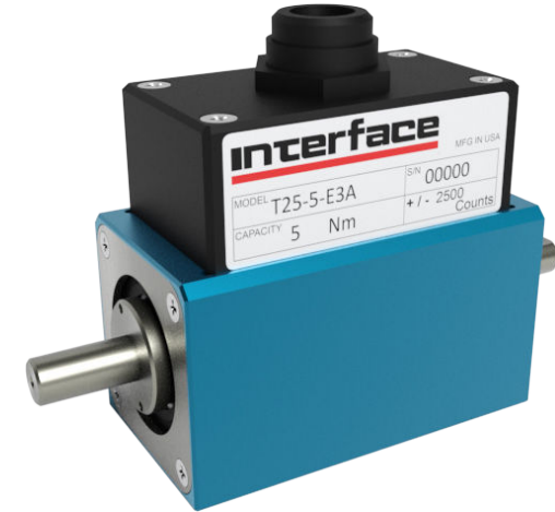
Model T25 (Shown)