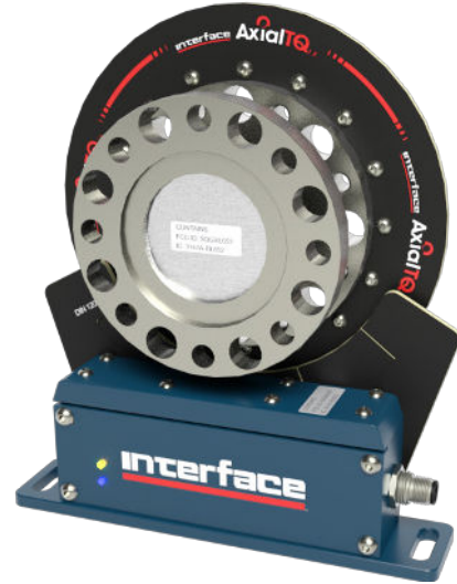
Model ATQ10D12-01KEX (Shown)