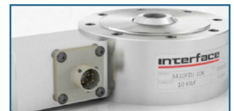
3416 Coil Tubing Load Cell