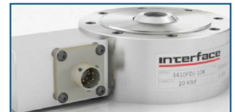
3420 Coil Tubing Load Cell