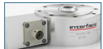
3432 Coil Tubing Load Cell