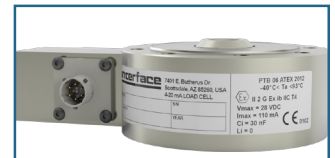
3410 Coil Tubing Load Cell

The coil tubing process has been used for decades, but not without its own set of unique challenges. The purpose of the tubing is to protect and optimize the insertion and extraction process. However, there is also a complicated and delicate insertion process for the coil tubing itself. The tubing is forced into the wellbore using a coil tubing injector head at an insertion rate of 50-100 feet per minute. During the injection process, the tubing is subject to damage such as buckling, which creates a failure condition called "lock up."