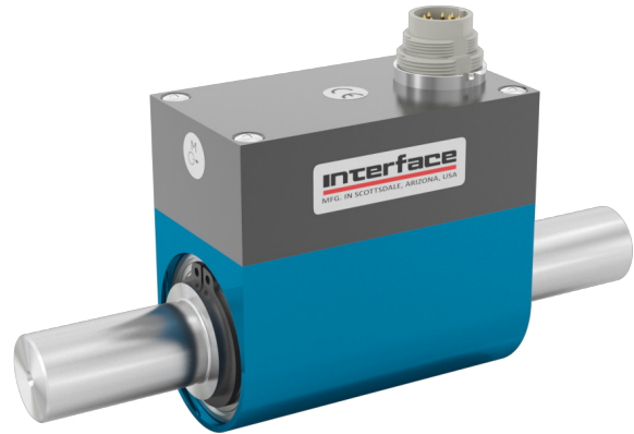
MODEL T6 (Shown)